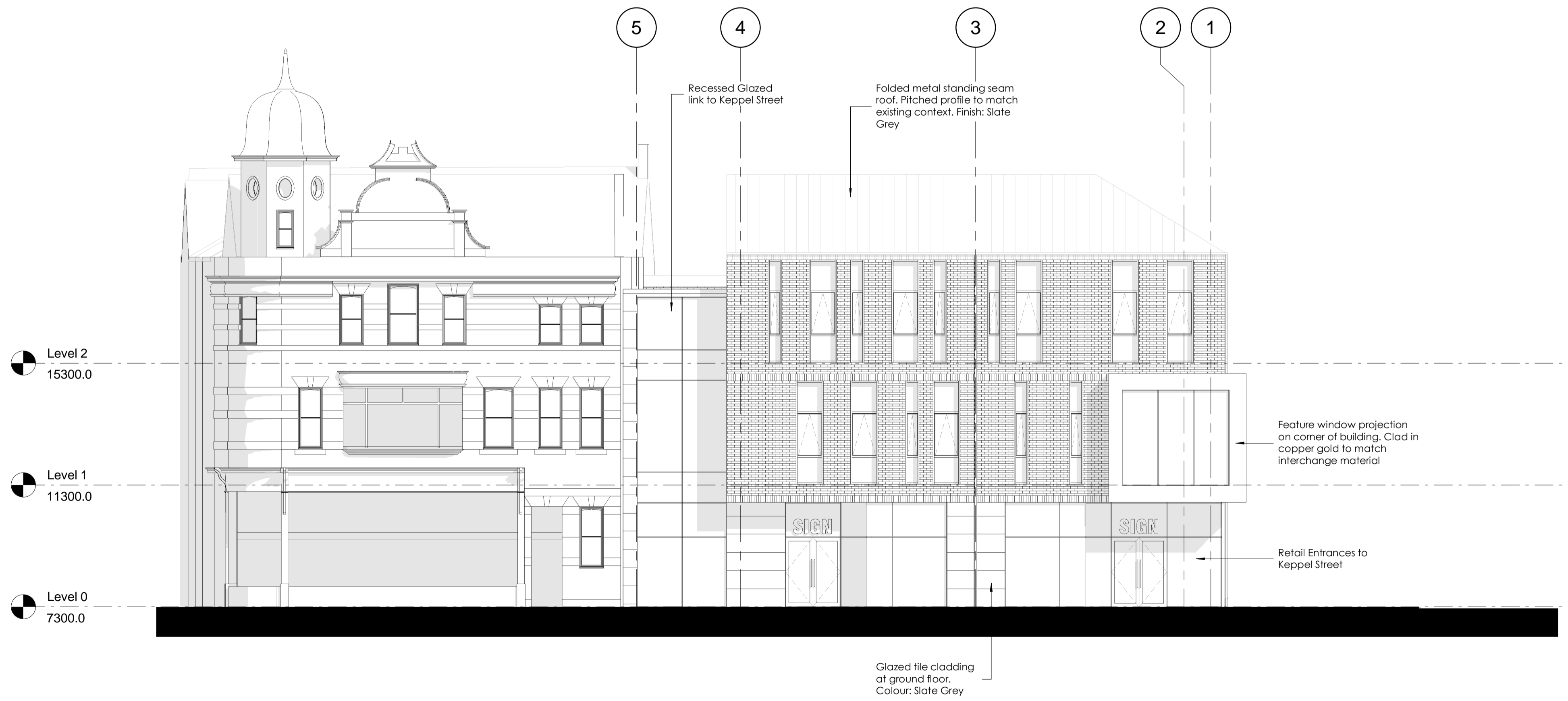
Elevation 3 - North Elevation